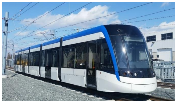
ION Light Rail Transit

In addition to the ION LRT, Meridiam's light rail project portfolio also includes the Firenze Tramway, the Nottingham Express Transit with Keolis and Maryland's Purple Line. Meridiam is developing with Keolis other projects in the field of clean and sustainable mobility, notably in Canada and Dakar, Senegal.